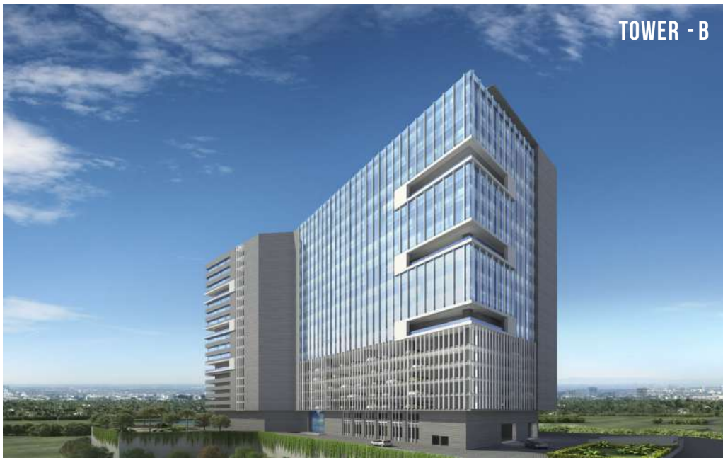
TOWER - B