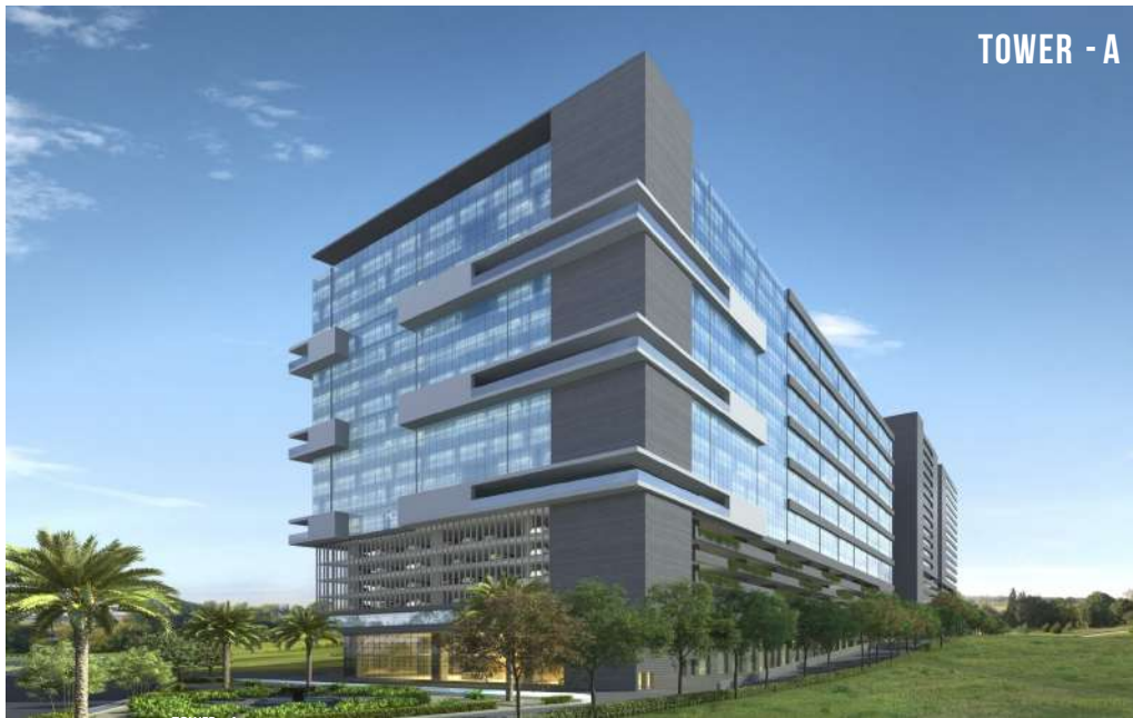
TOWER - A